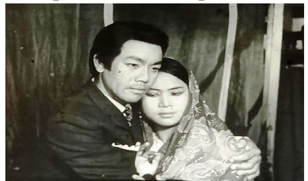
A scene from Brojendragi Luhongba (1972)