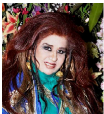
By: Shahnaz Husain

Skin fasting is a new-age beauty trend of taking a break from all of your current skincare products or routine and letting your skin naturally do its magic. Basically, it's like the fasting you practice with your diet, except this is for the skin and is in the spotlight owing to social media.